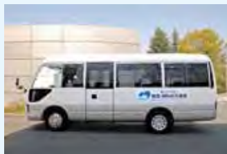
Logo marks on the AIST/NIMS shuttle buses